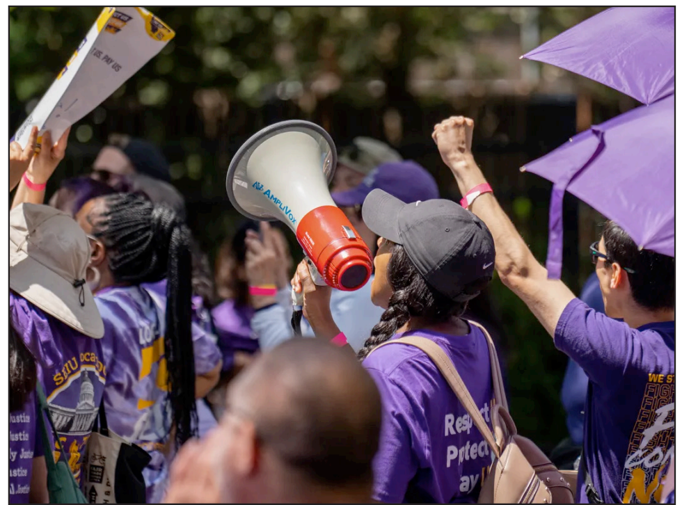
Supporters of SEIU Local 1000, rally in front of the Governor’s Mansion in Sacramento on June 8, 2023.

While serving in the Assembly, Gonzalez was one of the most successful legislators in getting bills enacted despite being designated by the chamber as job killers. She left the Legislature